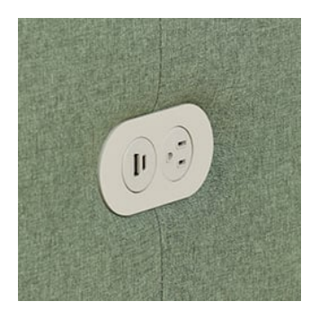
120V & USB-A+C