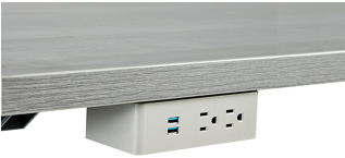
Ashley Duo W5.5" D2.8" H1.8"