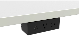
Dean Undersurface W5.5" D2.5" H1.875"