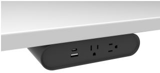
Dubbel Undersurface W7.6" D3.8" H2"