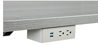
Ashley Duo W5.5" D2.8" H1.8"