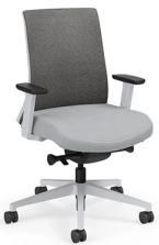
Signia Task Chair >

Delivering a beautiful, fully ergonomic, long-term sitting experience in your choice of task chair or stool.