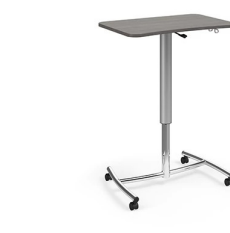
Ruckus Lectern >