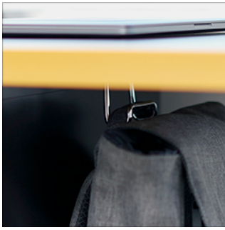
Book Bag Hook