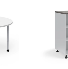
Ruckus Storage >