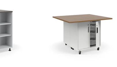
Ruckus Worktables >