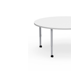
Ruckus Activity Tables >