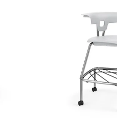
Ruckus Stool >