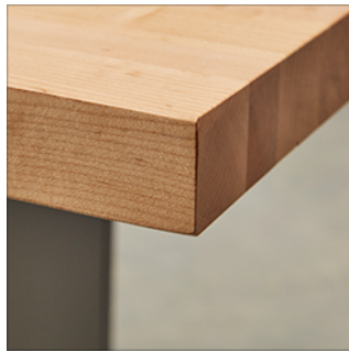
Butcher Block Wood 1.75" WBB Edge