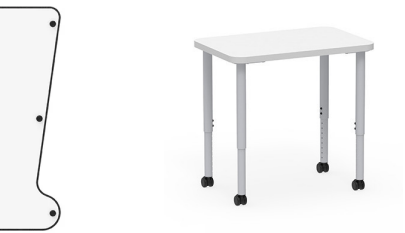
Ruckus Post- Leg Desks >