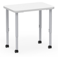
Ruckus Post- Leg Desks >