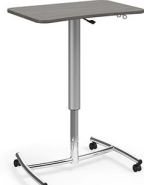
Ruckus Lectern >