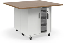
Ruckus Worktables >