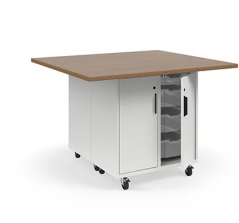
Ruckus Worktables >