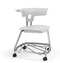
Ruckus Chair >

It's not so much an evolution as a revolution. It looks like nothing else. It can be used like nothing else. It's Ruckus: a simple, inspiring and incredibly innovative collection that supports today's learning space transformations.