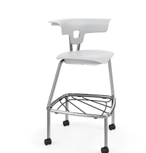
Ruckus Stool >