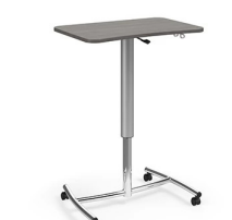
Ruckus Lectern >