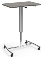
Ruckus Lectern >