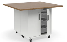
Ruckus Worktables >