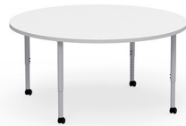
Ruckus Activity Tables >