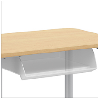
Poly Book Box *Available in Small and Large Sizes