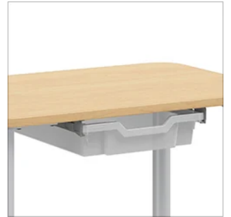
Removable Book Box