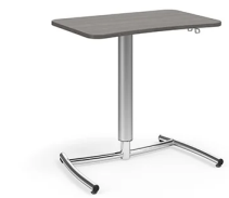
Ruckus Cantilever Desks >