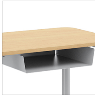
Steel Book Box *Available in Small and Large Sizes