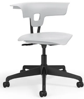
Ruckus Task Chair >