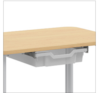
Removable Book Box