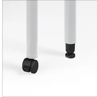
Casters and Glides