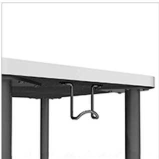
Book Bag Hook