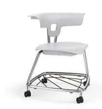
Ruckus Chair >

It's not so much an evolution as a revolution. It looks like nothing else. It can be used like nothing else. It's Ruckus: a simple, inspiring and incredibly innovative collection that supports today's learning space transformations.