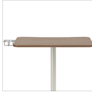
Swiveling Cup Holder *Available Left- or Right-Side