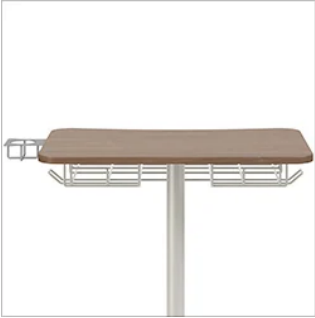
Swiveling Cup Holder and Book Basket *Available Left- or Right-Side