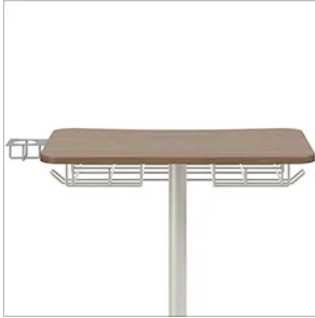
Swiveling Cup Holder and Book Basket