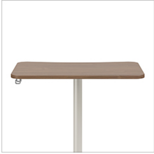
Book Bag Hook *Available Left- or Right-Side