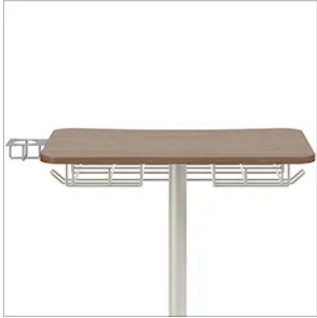
Swiveling Cup Holder and Book Basket *Available Left- or Right-Side