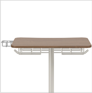
Swiveling Cup Holder and Book Basket *Available Left- or Right-Side