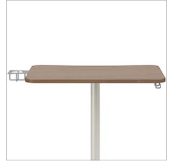
Swiveling Cup Holder and Book Bag Hook *Available Left- or Right-Side