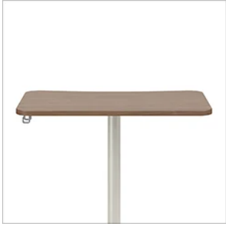
Book Bag Hook *Available Left- or Right-Side