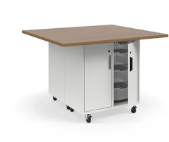
Ruckus Worktables >