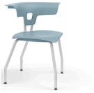
18" Seat Height with Glides W28" D29" H29.5" Seat: W22.3" D18.8" H18"