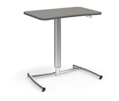
Ruckus Cantilever Desks >