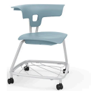
18" Seat Height with Casters and Book Bag Rack W28" D29" H29.5" Seat: W22.3" D18.8" H18"