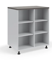
Ruckus Storage >