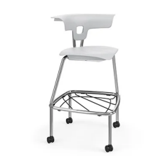
Ruckus Stool >