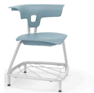
18" Seat Height with Glides and Book Bag Rack W28" D29" H29.5" Seat: W22.3" D18.8" H18"