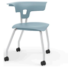
18" Seat Height with Casters W28" D29" H29.5" Seat: W22.3" D18.8" H18"