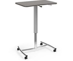
Ruckus Lectern >