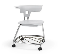
Ruckus Chair >

It's not so much an evolution as a revolution. It looks like nothing else. It can be used like nothing else. It's Ruckus: a simple, inspiring and incredibly innovative collection that supports today's learning space transformations.