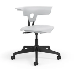
Ruckus Task Chair >