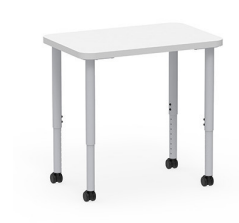
Ruckus Post- Leg Desks >