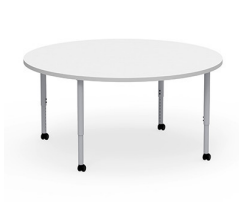
Ruckus Activity Tables >