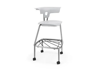
Ruckus Stool >