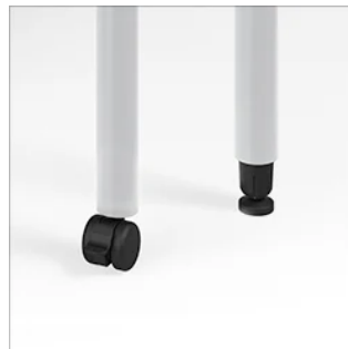
Casters and Glides