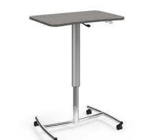
Ruckus Lectern >