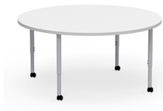
Ruckus Activity Tables >