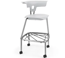
Ruckus Stool >