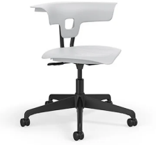
Ruckus Task Chair >