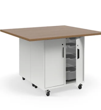
Ruckus Worktables >