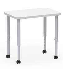
Ruckus Post-Leg Desks >