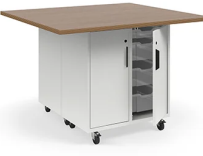
Ruckus Worktables >