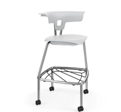
Ruckus Stool >