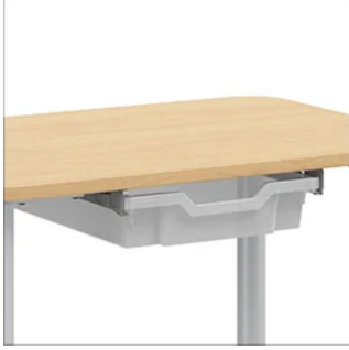
Removable Book Box