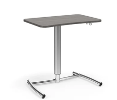
Ruckus Cantilever Desks >