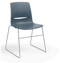
High-Density Stack Chair