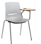
Flip Up Tablet Arm W23.75" D28" H33.25" Seat: W18.25" D17.5" H17.5"