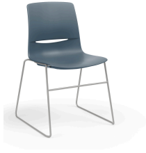
High-Density Stack Chair