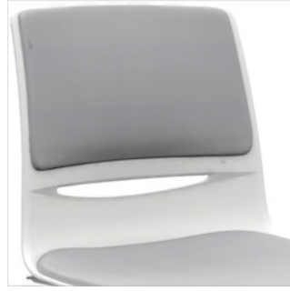
Upholstered Seat and Backrest