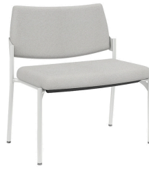
XL Bariatric Chair