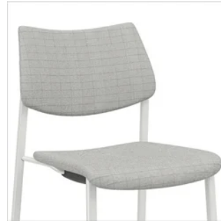
Upholstered Seat and Back