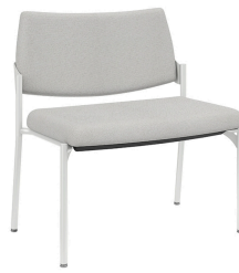
XL Bariatric Chair