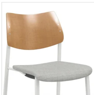
Upholstered Seat and Wood Back