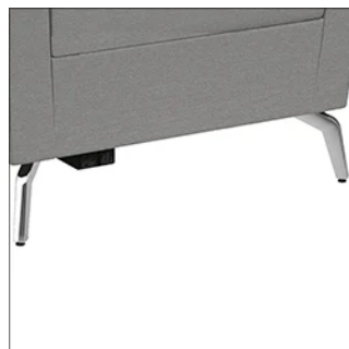
Power Module *Available in Black or White