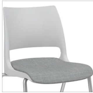
Solid Poly with Upholstered Seat