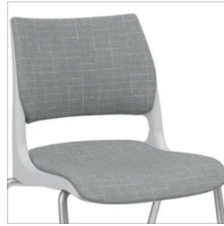
Solid Poly with Upholstered Seat and Back