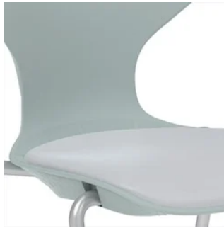
Upholstered Seat *Available on Large only